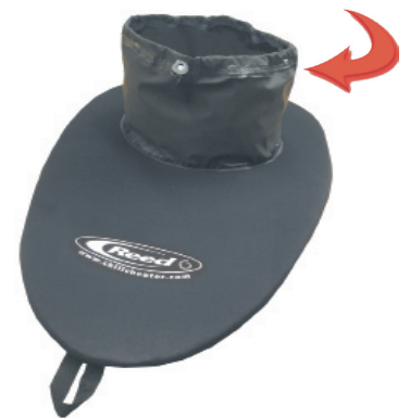
SUPER TOUR SPRAY DECK PRODUCT CODE: NSDT

STILL UNSURE AS TO WHICH COCKPIT SHAPE TYPE YOUR BOAT MAY BE? PLEASE CHECK BY USING THE SIZE / TECHNICAL GUIDES BACK ON THE PRODUCT PAGE.