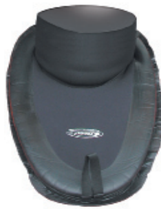
NEOPRENE DECK + DRY LIP P3 PRODUCT CODE: NSDP3 Cockpit Shape Suitability: Keyhole A Keyhole B Keyhole Plastic