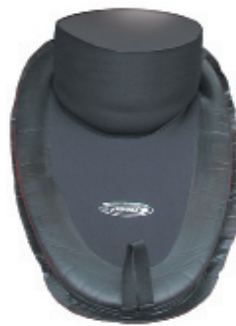
NEOPRENE DECK + DRY LIP P4 PRODUCT CODE: NSDP4 Cockpit Shape Suitability: Keyhole C