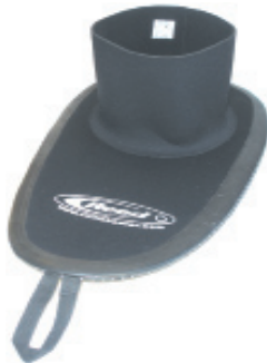
NEOPRENE K1 DECK+ LATEX TOP PRODUCT CODE: NSDK1 Cockpit Shape Suitability: K1 Polo Boats Low Volume Slalom Boats