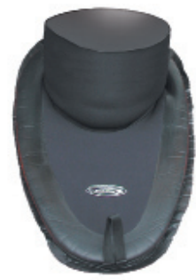
NEOPRENE DECK/ DRY LIP RIOT PRODUCT CODE: NSDRT Cockpit Shape Suitability: Riot Boats Surf Kayaks