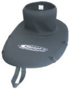
NEOPRENE SEA DECK + LATEX UNDER PRODUCT CODE: NSDSD Cockpit Shape Suitability: Keyhole A Keyhole B Keyhole Plastic